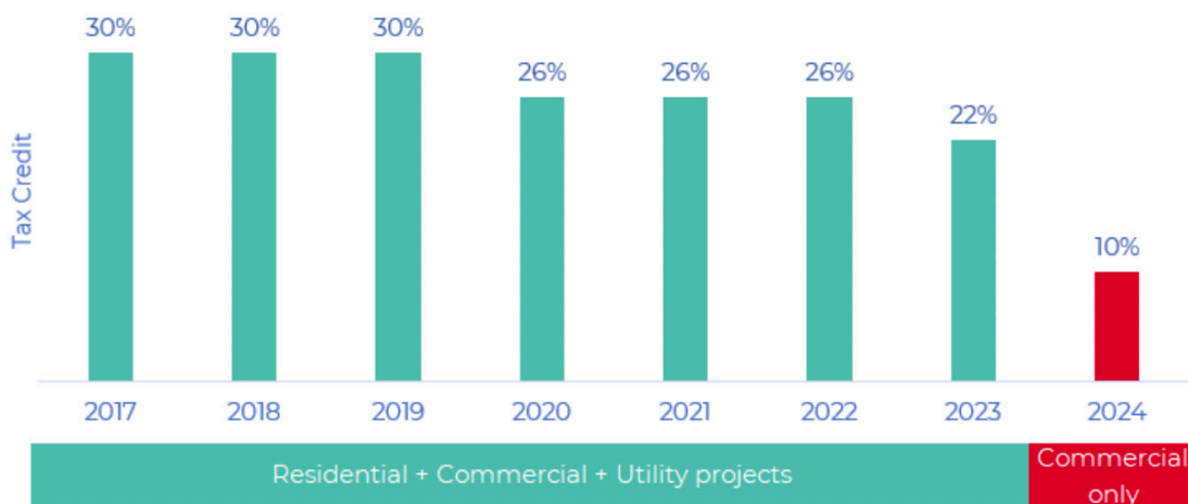
Recent History of the Investment Tax Credit

The ITC was first implemented in 2006 and has helped to spur the nation’s solar industry, allowing companies and consumers to reduce their tax bill by a percentage of the cost of the installed solar system. From an initial level of 30%, the ITC stands at 26% through 2022 and is set to fall to 22% in 2023 and to 10% in 2024 and beyond (only for commercial customers). The proposed Act would provide a 10-year extension of the ITC, restoring the credit to 30% through 2032, before stepping it down to 26%/22%/0% in 2033/34/35. It provides additional 10% “bonus” credits for systems installed in low-income communities or systems where over 40% of the iron, steel, or manufactured components are sourced domestically. This implies that certain projects could qualify for up to a 50% ITC. For the first time, the ITC will also be made eligible for stand-alone energy storage, heat pumps, and water heaters.